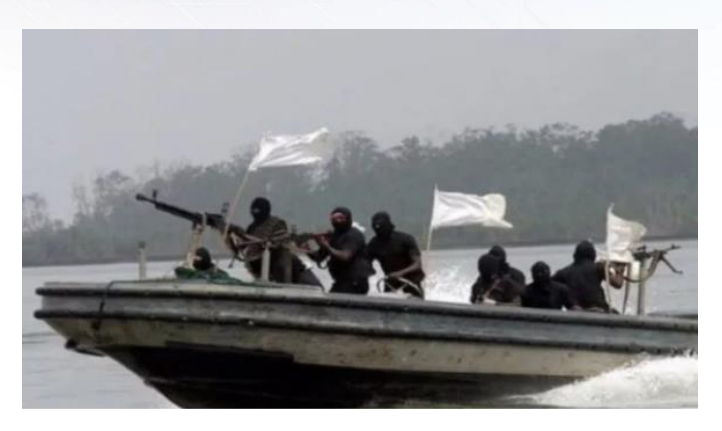
Armed pirates on the sea